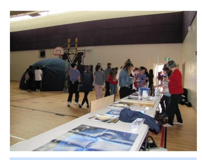
Planetarium and Exhibition Table